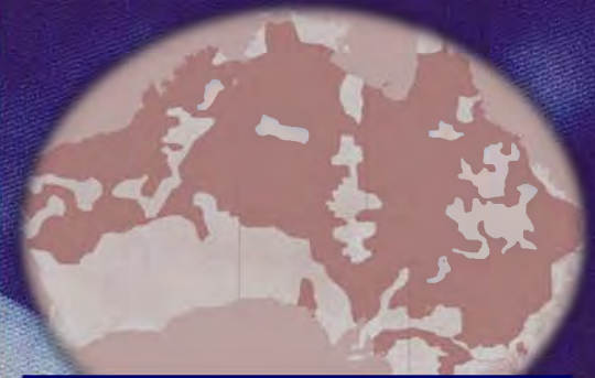
The Distribution of the Diamond Dove

Ochre Pied Red Snow white Silver white tail Diamondless pattern